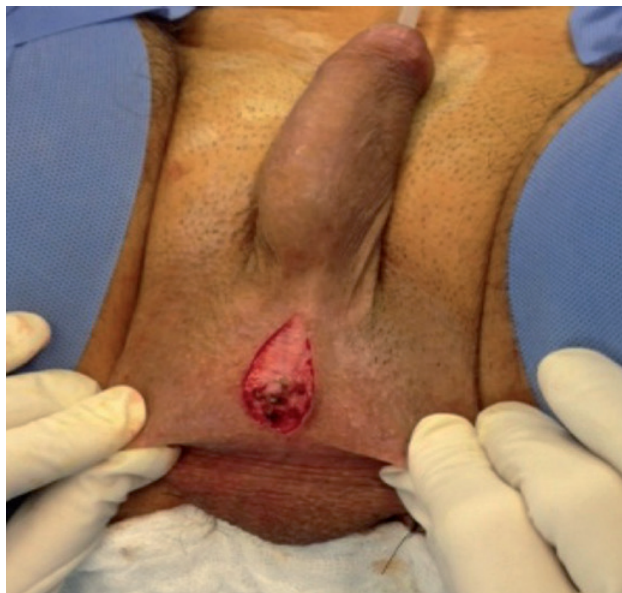
Figure 2 - Bulbar urethra placement of AS in modified scrotal approach.